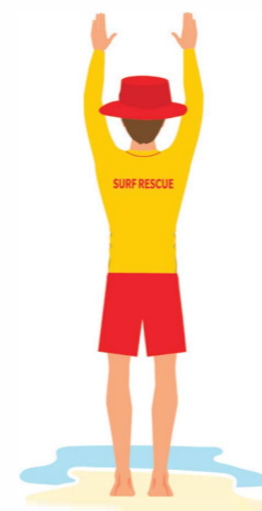
3. Proceed further out to sea