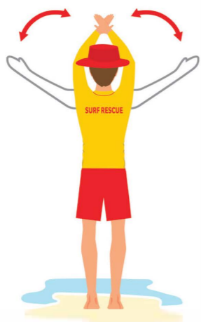
1. Attract attention