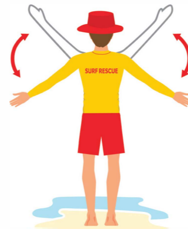
7. Pick up or adjust buoys