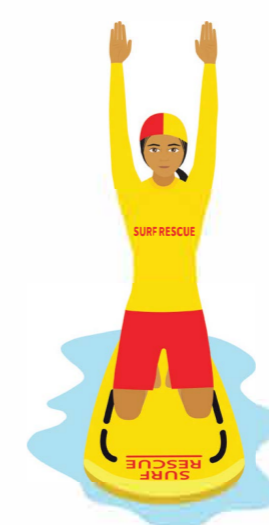
11. Emergency evacuation alarm