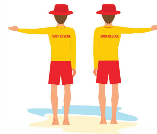
4. Go the right or to the left