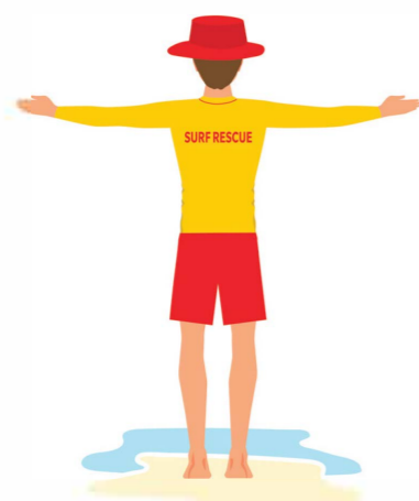
5. Remain stationary