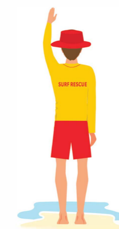
8. Return to shore