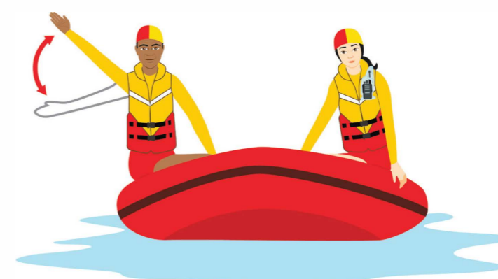
14. Powercraft wishes to return to shore