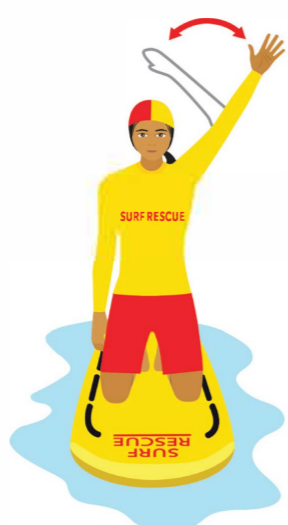
9. Assistance required