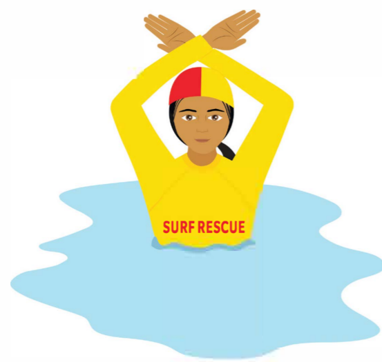
12. Submerged victim missing