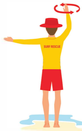
2. Pick up swimmers