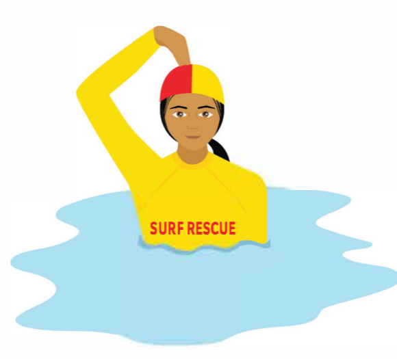
13. All clear/ok